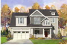
Optional Elevation 2