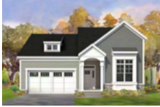
Optional Elevation 1