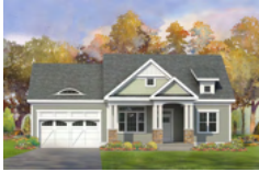
Optional Elevation 1