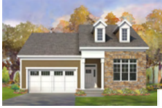
Optional Elevation 2