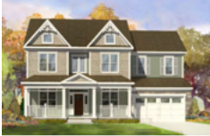
Optional Elevation 2