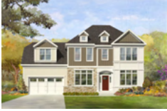
Optional Elevation 2