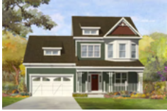
Optional Elevation 1