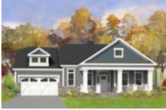
Optional Elevation 1