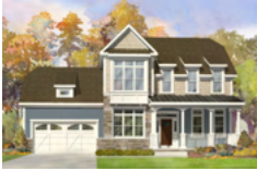
Optional Elevation 1