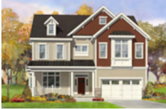
Optional Elevation 2