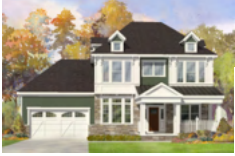
Optional Elevation 2