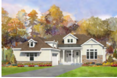
Optional Elevation 1