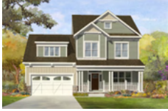
Optional Elevation 2