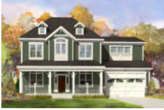
Optional Elevation 1