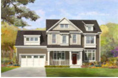
Optional Elevation 1