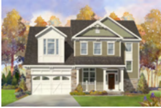
Optional Elevation 1