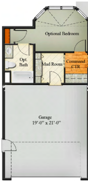
Optional 1 st Floor BR & Bath